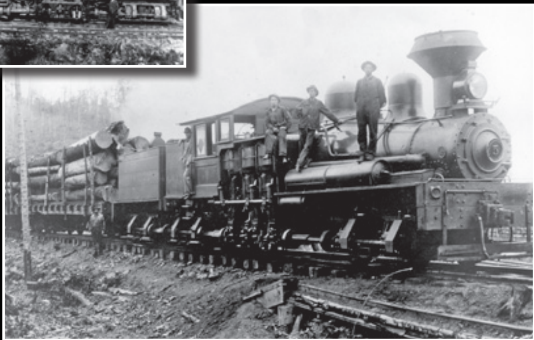
Inset Photo: A Shay locomotive appears to be descending Cheat Mountain toward Cass in this circa 1915 photograph.