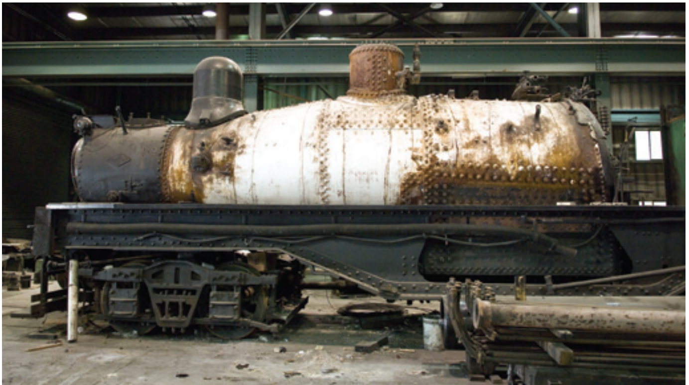
The Cass Locomotive Shops restore, repair, and maintain the locomotives and passenger cars to precise standards. Shay #2, shown in the photograph, is currently undergoing extensive servicing that is expected to be completed by summer 2011.