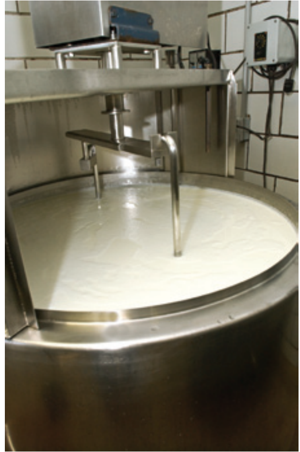
Below: The first step for the goat's milk is to be placed in this 130 gallon Pasteurizer for two hours (a Maryland law) where it agitates, spins, and is heated to the proper temperature.