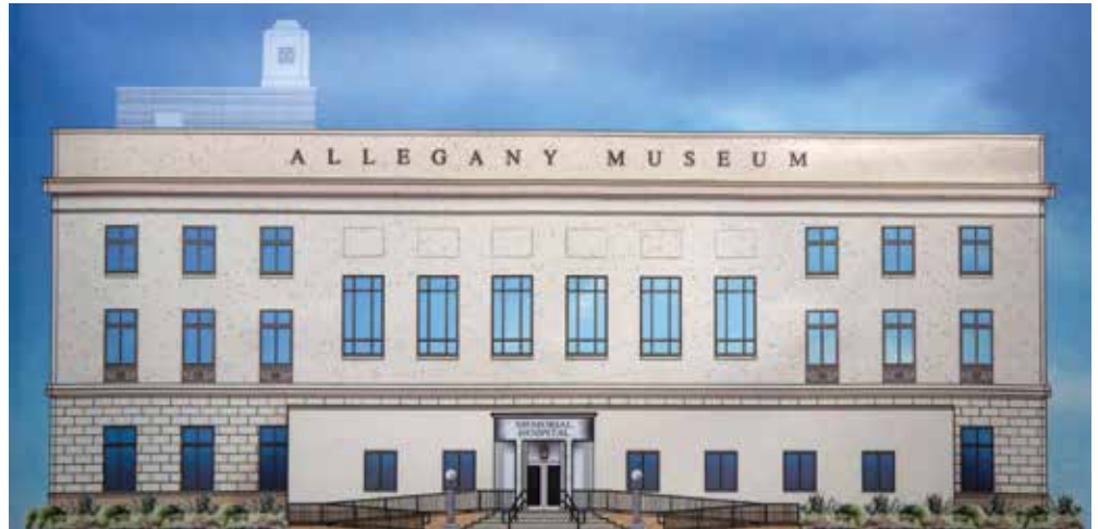
Artist rendition of completed south side entrance.

With Phase 1 now complete, a ride through Cumberland along I-68 presents an impressive sight. Rolfe feels strongly that people visiting Cumberland, or living nearby, should have a visual reminder, as they travel through town, of the exceptional nature of this quality museum's display of area history. Visiting the museum is a walk down memory lane