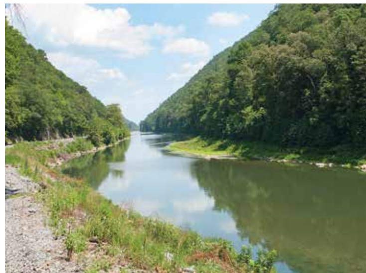
The gorge known as the Trough along the South Branch of the Potomac River is home to American bald eagles.