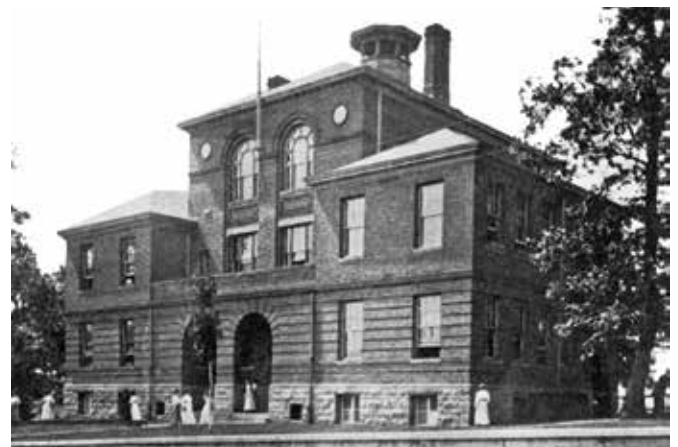
"Old Main," which housed classrooms and a library, was the first campus building at State Normal School No. 2.