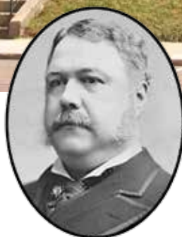
James A. Garfield