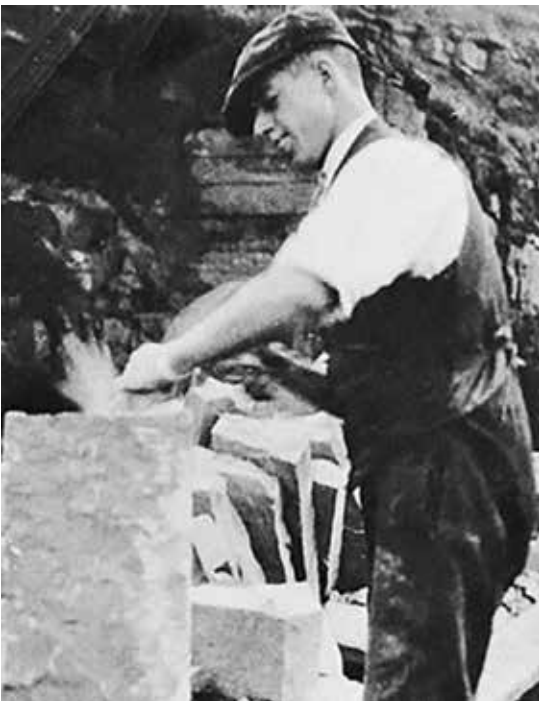
Cinder block sized stones from B&O property at the Cheat River quarry supplied the building material for the original church.

Garrett County residents. The unique church also blends a remarkable secular history with its contemporary spiritual mission.