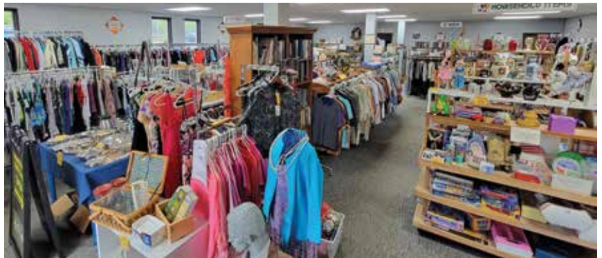
Left: Interior of the remodeled St. Matthews Episcopal Church. Above: "Nearly New" Thrift Shop located at the church.

August 19, 2020, a large crane transported the structure to a parking lot where it unexpectedly collapsed during the night.