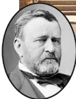
Ulysses S. Grant