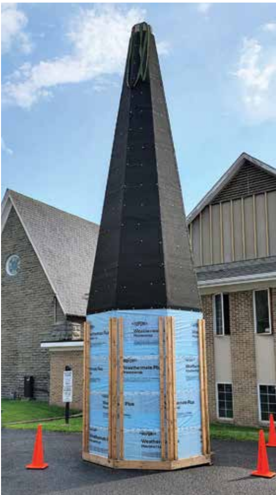
At press time, the duplicate steeple has been delivered to the church awaiting final finishing before placing onto the bell tower.