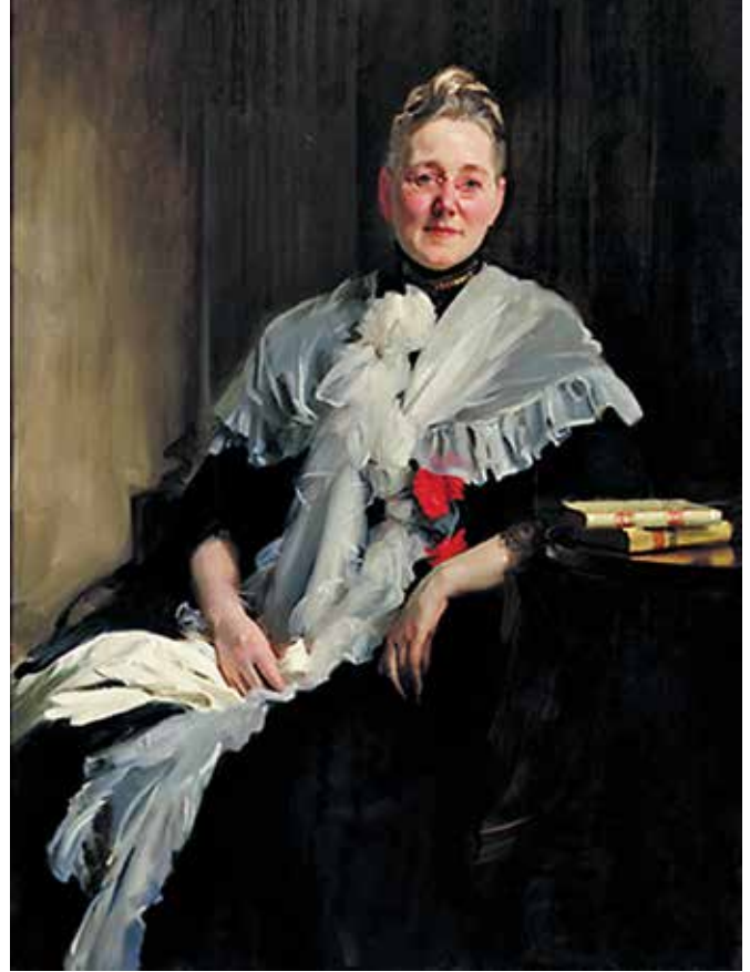
This 1904 painting of Mary Elizabeth Garrett by John Singer Sargent was commissioned by the trustees of the Johns Hopkins Medical School, but Mary chose the painter, traveled to London to pose, and paid half the cost.

Mary and two friends formed a reading group that met every other Friday when they were schoolgirls. They called themselves the "Friday Night." Later, two more young