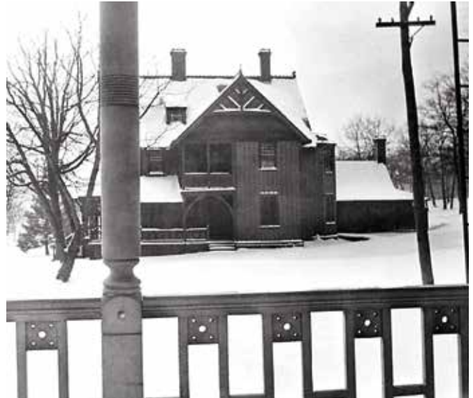
The Garrett cottage at Deer Park, MD, one of the properties Mary inherited in her father’s will.

Mary used some of her funds to maintain the extensive holdings she had inherited—two homes in Baltimore and the cottage in Deer Park, a total of twenty-five hundred acres in Western Maryland and Baltimore, B&O Railroad stock shares, and many income-producing rental properties. She continued her lifestyle of traveling and socializing. She helped in the transition of the railroad to her brother’s leadership. Later, with one invalid brother, one whose health collapsed, and one who died in a boating accident,