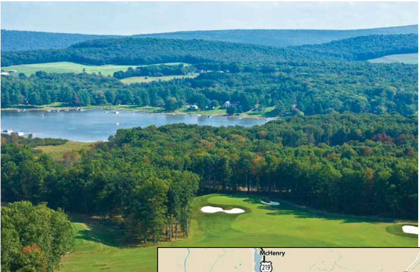
Thousand Acres Golf Course is located on a peninsula on the southern end of Deep Creek Lake.