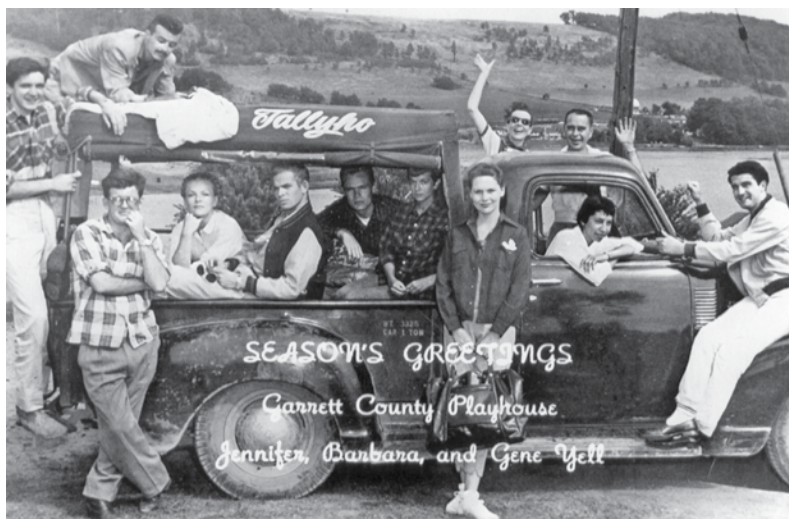
Top photo: Original location of the Garrett County Playhouse, the former Arden Boat Club; a lakeside property at McHenry Cove, Deep Creek Lake. Note all of the open spaces around the Lake.

If you want to know more about this and other aspects of local history, the Garrett County Historical Society has some exhibits — and some archives — that you'll thoroughly enjoy.