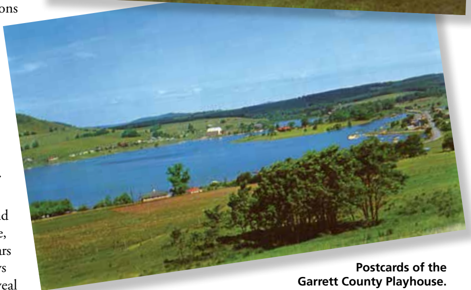
Postcards of the Garrett County Playhouse.

Top: The "Blue Barn" at its 2nd location on Beckman Peninsula Road. Bottom: Deep Creek Lake at McHenry Cove, looking towards Marsh Mountain (Wisp). The Playhouse is the white barn in the middle of the photo.