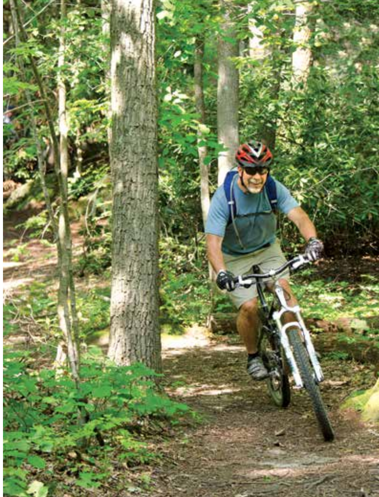
Mountain biking near Deep Creek Lake in Garrett County, Maryland, with moderate to difficult terrain.

Set for June 23, 2018, the Garrett County Gran Fondo offers five supported ride options for cyclists with skills ranging from recreational to professional. “Garrett’s Greatest 25” features a scenic 25-mile course through rolling farmland with no major hills. For more of a challenge, there’s the