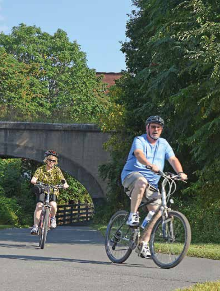
Riding for fun and exercise along the Great Allegheny Passage (GAP) near Cumberland, Maryland.

directed to use the 1.5 mile Tunnel Hill Detour. It's pretty smooth riding during the final leg of the Towpath, which includes several scenic, re-watered sections of the Canal. During warm weather, cyclists should be on the lookout for an abundance of turtles sunning themselves on the trail.