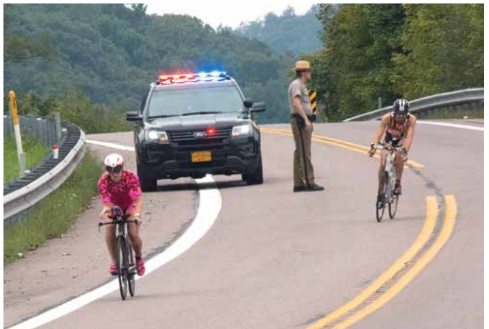
All three photos: Bicycle portion of the SavageMan Triathlon Festival in Garrett County, Maryland.