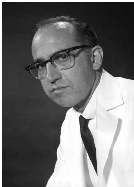
Above: Jonas Salk, circa 1954-1955.