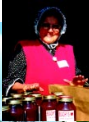
Freshly make apple butter, Springs Folk Festival