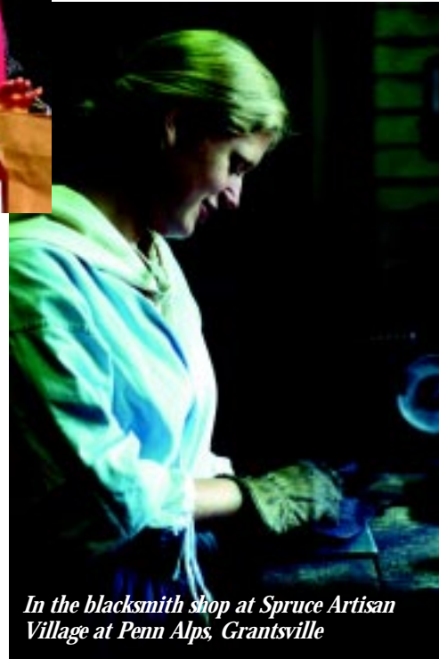
In the blacksmith shop at Spruce Artisan Village at Penn Alps, Grantsville