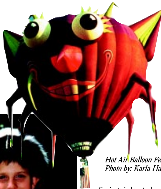
Hot Air Balloon Festival

Paintings, baskets, wood crafted furniture, quilts, and dulcimers—over 140 juried artisans demonstrating their craft. Sample the homemade lollipops, funnel cakes and homemade ice cream. Pennsylvania Dutch sausage meals, pancakes and sausage, bean soup, homemade bread baked in an outdoor kiln, doughnuts fried as you watch. All of this, plus the opportunity to walk through the woods trail in the splendor of fall color and stop by the maple sugar camp along the way.