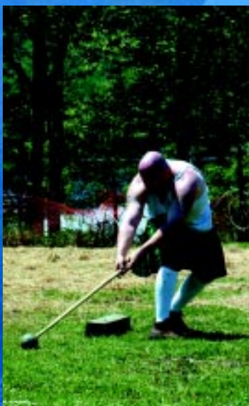
Photo sequence at right shows hammer throwing, one of the game events. Each participant wears specially made shoes with large blades sticking straight out the front of them. He digs these blades deep into the ground because the hammer is so heavy it would pull him off balance as it is swung in a circle before release. These photos show how much pull there is from the solid lead hammer.

The authentic Scottish games and demonstrations of all types are a sight to see!