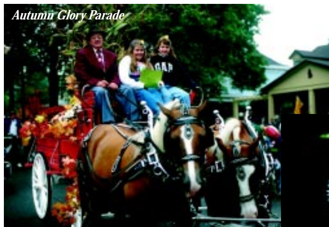
Autumn Glory Parade

or Garrett County Chamber of Commerce at 1-800-800-5557 www.garrettchamber.com