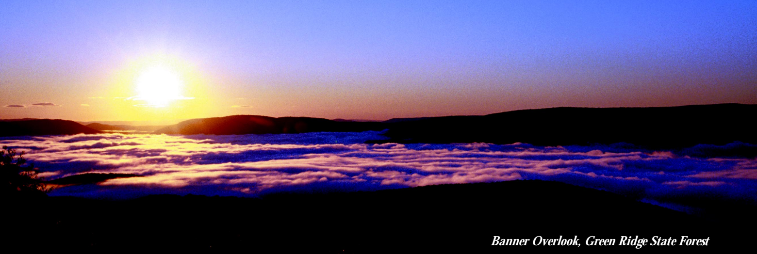
Banner Overlook, Green Ridge State Forest