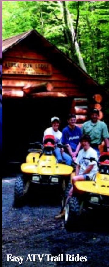
Easy ATV Trail Rides