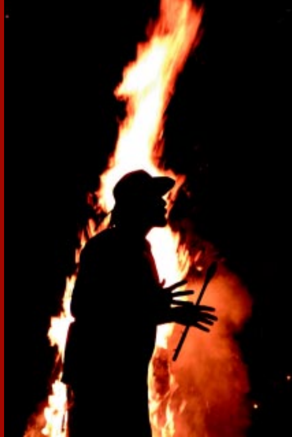
Camp Earth bonfire extravaganza—drum beating, dancing and story telling for all at Deep Creek Lake State Park.

Each Nature Tourism (NT) office tailors their outdoor adventure offerings to utilize the natural geography of the area, with some understandable overlapping. For instance, activities such as rappelling, caving and rock climbing might be more popular in Allegany County,