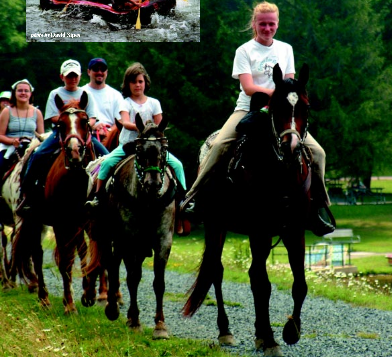
Broken Bar Stable Trail Ride at Herrington Manor State Park.