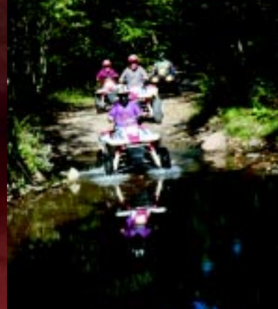
ATV Trail Rides