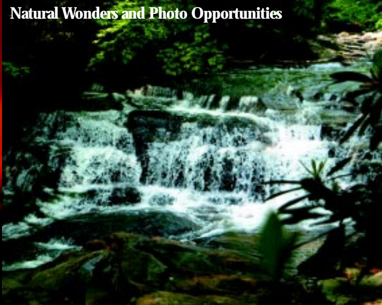
Natural Wonders and Photo Opportunities