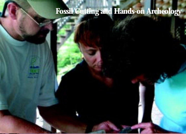
Fossil Cutting and Hands-on Archeology