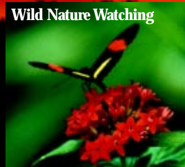
Wild Nature Watching