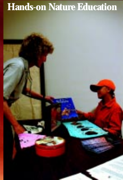
Hands-on Nature Education