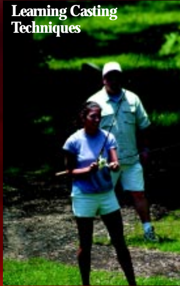
Learning Casting Techniques