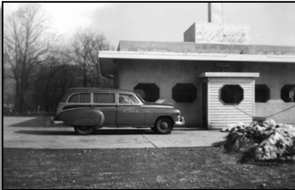
In the early years Gehauf's was Cumberland's other hot dog stand.