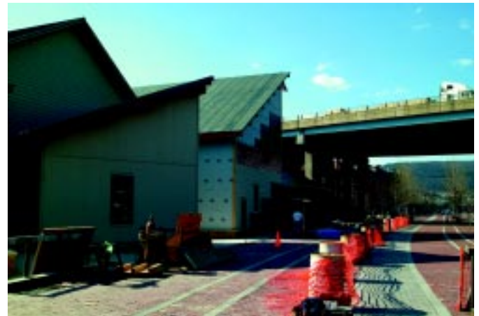
New facilities and attractions at Canal Place are near completion. Completion is expected by Memorial Day.