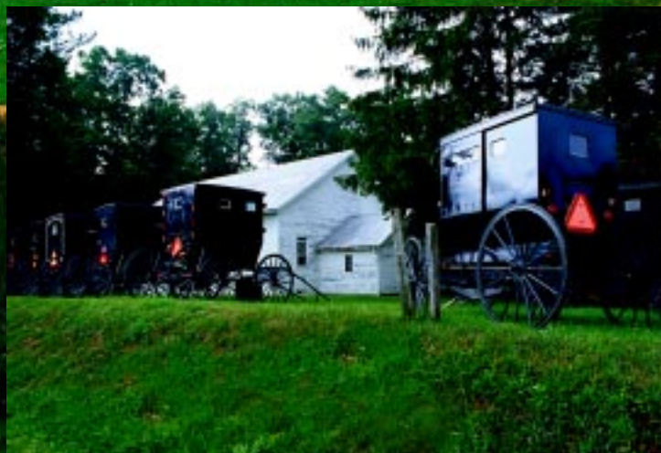
Traditional buggy rides to Sunday church services remain an integral part of Gortner Amish tradition.

Background photo: Springtime brings forth the annual renewal of life to the rural landscape.