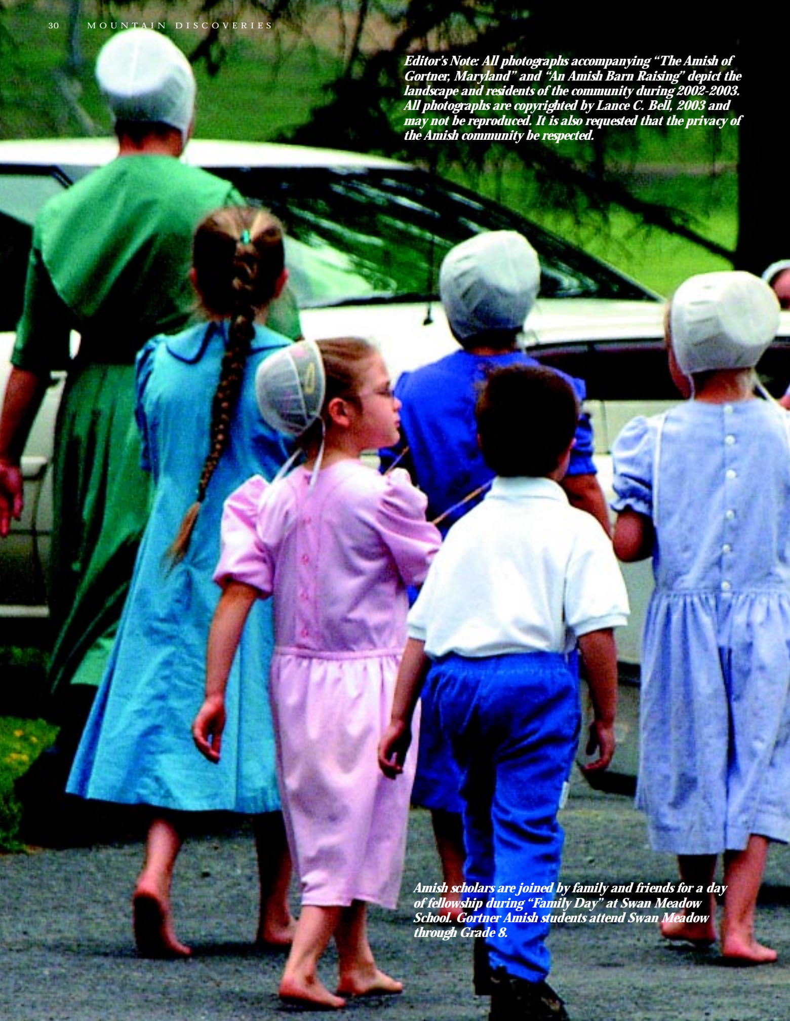
Amish scholars are joined by family and friends for a day of fellowship during "Family Day" at Swan Meadow School. Gortner Amish students attend Swan Meadow through Grade 8.

Editor's Note: All photographs accompanying "The Amish of Gortner, Maryland" and "An Amish Barn Raising" depict the landscape and residents of the community during 2002-2003. All photographs are copyrighted by Lance C. Bell, 2003 and may not be reproduced. It is also requested that the privacy of the Amish community be respected.