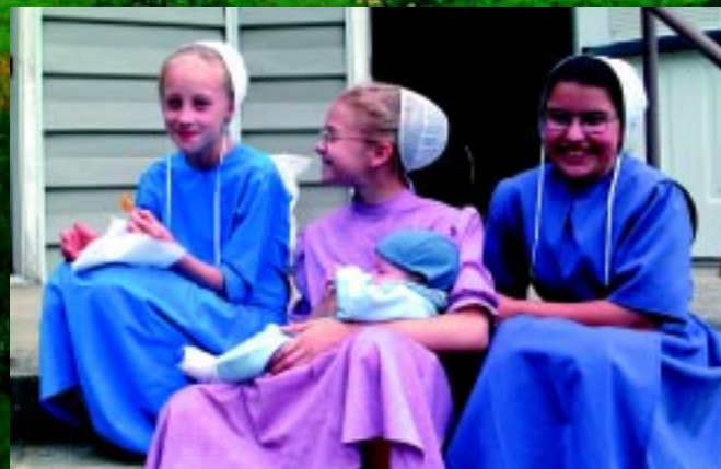
Swan Meadow scholars enjoy the company of a future student during "Family Day."

Editors Note: This story and photos were prepared with the help, cooperation and approval of the Amish Community of Gortner in Garrett County, Maryland. We would like to thank them for allowing us to document their story and history.