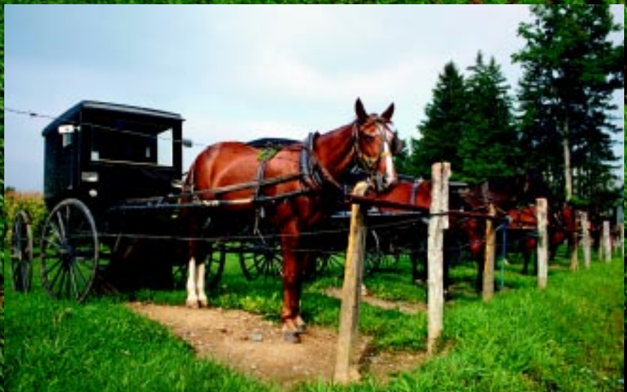
Soybean fields are carefully cultivated near the Gortner Amish Church. Horses are tied to hitching posts adjacent to the church. Services are held every other week.