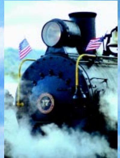
Area attractions to please everyone.

A primitive campground, and 7 public boat launches round off the amenities available to our guests. Nature provides some bonus gifts to visitors who experience a view of the nesting American Bald Eagles, river otters and soon, the osprey in addition to the typical wildlife viewing one would expect in this natural setting.