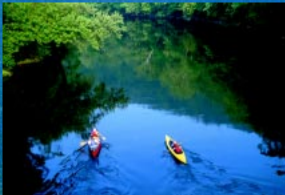
Paddle the still waters of the Juniata River, main tributary of Raystown Lake.

a short drive north of Cumberland, Maryland